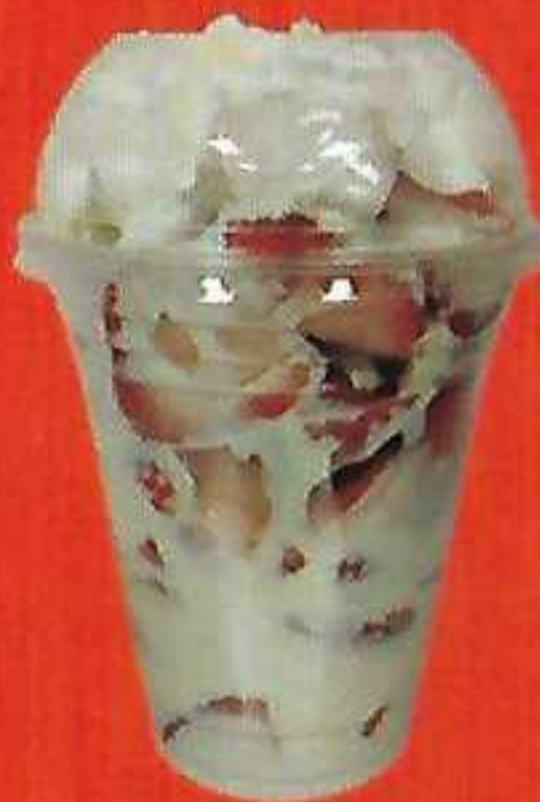
Strawberries & Cream Fresas con Crema